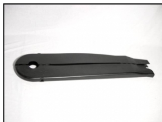
Chain Guard Components (52.31.06.01) $62.37