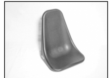
Seat in black (52.02.14.71) $51.03