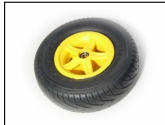
Wheel left yellow Slick (42.10.11.35) $85.05