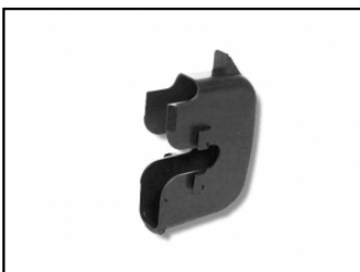
Back cover for chain guard (52.02.15.00) $23.62