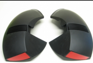
Plastic Mudguard deluxe black (15.03.11.00) $56.70