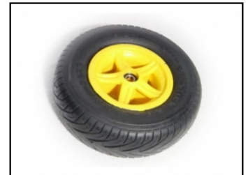
Wheel right yellow Slick (42.10.11.36) $85.05