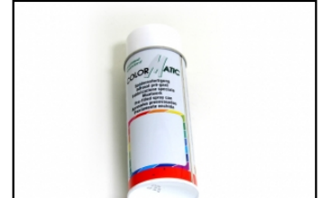
spray can red Ral 3020 (15.08.05.00) $20.78