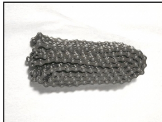
Chain 140 links (40.01.31.40) $28.35