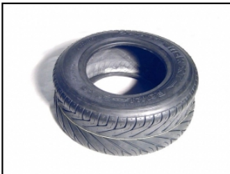
Tyre Slick 400/140x8 (42.22.21.00) $60.47