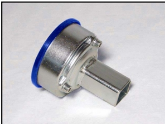
Freewheel (Left) (15.09.21.00) $111.50