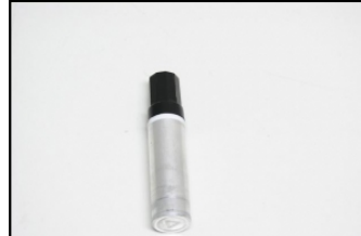
Paint pin red RAL 3020 (15.07.83.00) $13.21