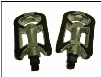
Set pedals FP-910 (40.01.12.20) $25.52