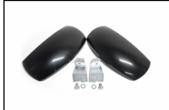
Front-Mudguards, black (15.03.31.00) $54.80