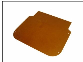
Wooden board bottom Clipper (50.53.42.04) $46.78