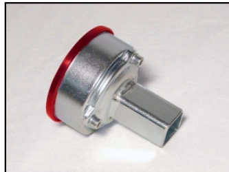
Freewheel (Right) (15.09.22.00) $111.50