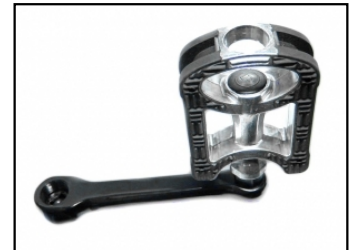
Crank Prof Left, 140 (40.01.10.55) $22.68