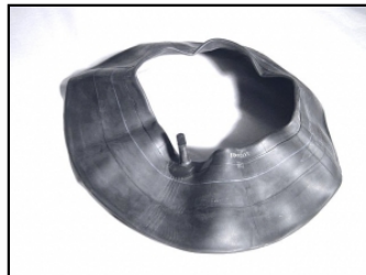
Inner Tube 400/650x8 (42.32.01.00) $11.34