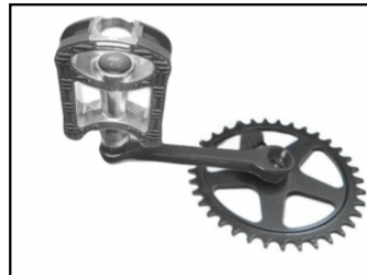
Crank Prof Right, 140x36-T (40.01.10.54) $28.35