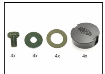
set wheel bolts + covers (4) (56.01.10.10) $7.54